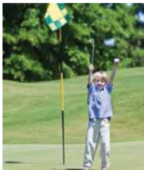
Ecological management for next generation golfers

A longtime composter, Spring Lake produces compost on-site from a blend of food waste, turf clippings, and leaves. Carls then uses the compost to brew batches of compost tea in a GEOTEA Compost Tea Machine . “We selected the GEOTEA brewer because it’s extremely well made and its extraction system really does produce a superior quality tea,” says Carls. The resulting brew is tested on-site for microbial count and diversity. To stimulate microbial activity, Carls uses a recipe with humic acid, hydrolyzed fish, seaweed, and molasses. To brew a more fungally dominant batch, he pre-activates the compost with oats. In either case, the compost tea is applied as a turf drench or foliar spray on garden beds.