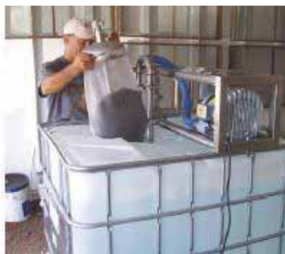
GEOTEA™ Compost Tea Machine with high-efficiency extraction system

How do you make it? To brew high quality compost tea, you need four components: 1) first and foremost, high quality compost or vermicompost that has been tested to exceed minimum criteria for microbial count and diversity; 2) the correct mix of microbial foods to stimulate growth and reproduction during the brew process; 3) dechlorinated water; 4) a high-performing brewer—the GEOTEA Compost Tea Machine —to efficiently extract and aerate, without damaging, the compost's microbial population, so you realize maximum benefit.